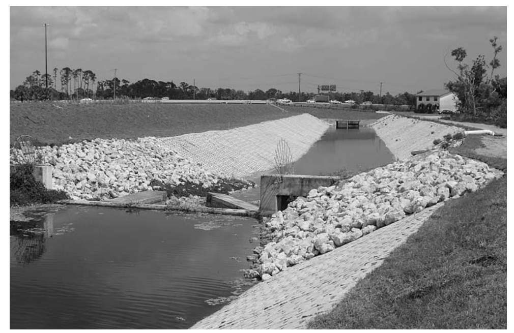
The SR706 Outfall Canal project features concrete block mats and rip-rap that stabilize canal banks