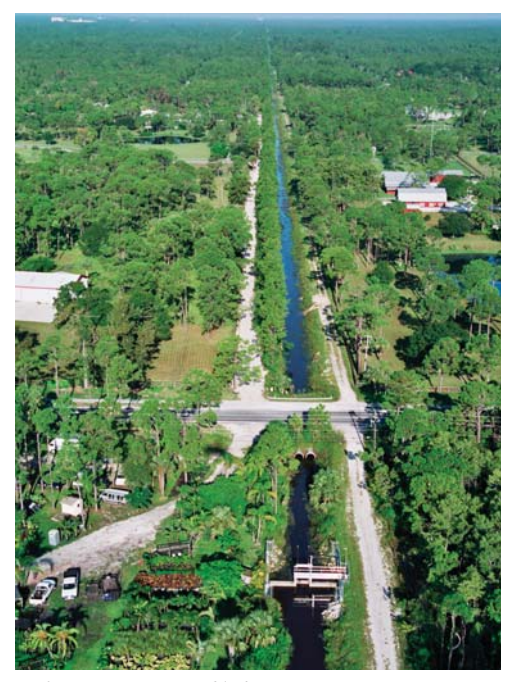
The District is responsible for managing over 12,000 acres

The goals and objectives of SIRWCD are consistent with those for the Northern Palm Beach County Comprehensive Water Management Plan, the Loxahatchee Basin Ecosystem Management Area, and the Comprehensive Everglades Restoration Plan. The District will continue to work with South Florida Water Management District and other agencies in developing and