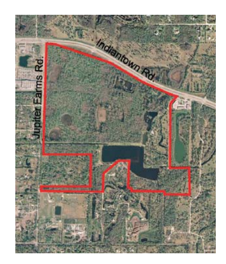
SFWMD issued a permit for the project on July 5, 2011. Palm Beach

A permit application has been submitted and approved by SFWMD and copied to SIRWCD. In accordance with Board direction, staff submitted a letter of conceptual approval to Palm Beach County subject to satisfying certain items that were discussed at the Board of Supervisors meeting.