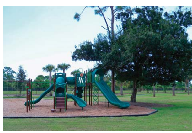
Newly-instaslled playground equipment at the Margaret Berman Memorial Park in Palm Beach Country Estates

In order to aid in flood control, the District extended Canal 3 directly to the east into the NW Fork of the Loxahatchee River in Riverbend Park. The District has an existing canal right-of-way in the project area that is consistent with the original intent of the Sixth Plan of Reclamation to connect at this location. Prior to construction of the extension,