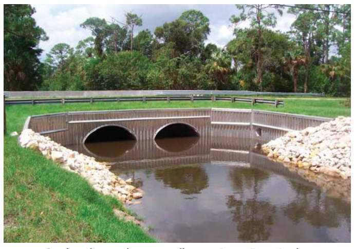
Canal 2 culverts and riprap installation at Jupiter Farms Road

The District's office is open and available to any interested landowners from Monday through Friday between the hours of 8:00 am and 4:30 pm. You are invited to stop by and make us aware of any problems or concerns with which we can assist you within the scope of our responsibility and authority. You can also access detailed information about the District on our website at www.sirwcd.org.