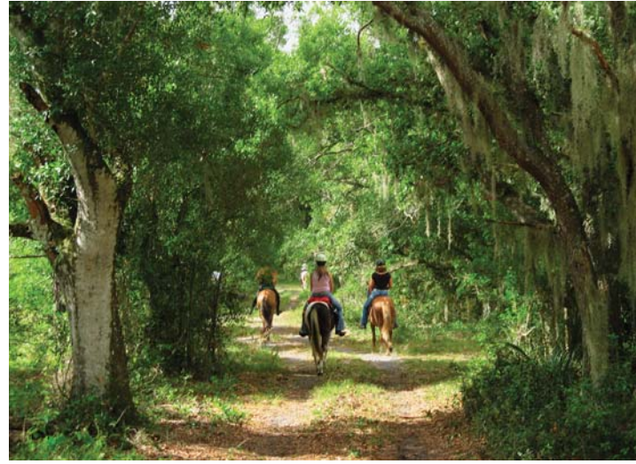
District landowners enjoy riding their horses in natural areas of the District

AECOM has appreciated the opportunity to continue serving as the South Indian River Water Control District Engineer, and we look forward to working with the Board of Supervisors, landowners, and in the coming year.