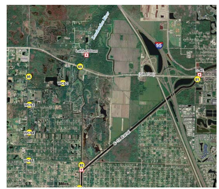
LRD Water quality monitoring stations

In July 2011, SIRWCD entered into a contract with a water sampling and testing firm. The samples are tested to analyze the surface water and groundwater for various metal, organic and inorganic contaminants as well as water quality criteria. The Lateral Control Structures as part of the 9th Plan of Improvements have provided the District with a significant amount of water level monitoring data that is very valuable to better manage the system for flood protection and environmental benefits.