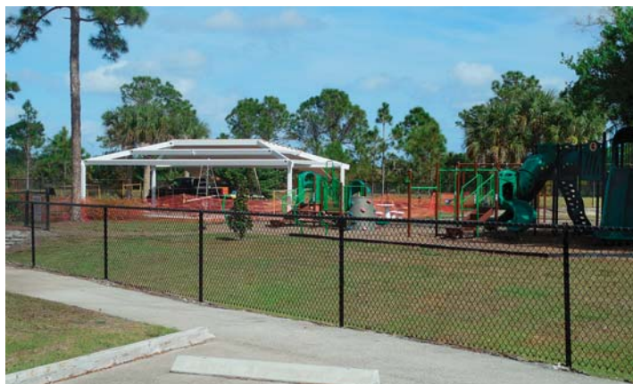
The largest pavilion is being constructed near the playground equipment

The permit was approved and the contractor began construction of the improvements on January 5, 2015.