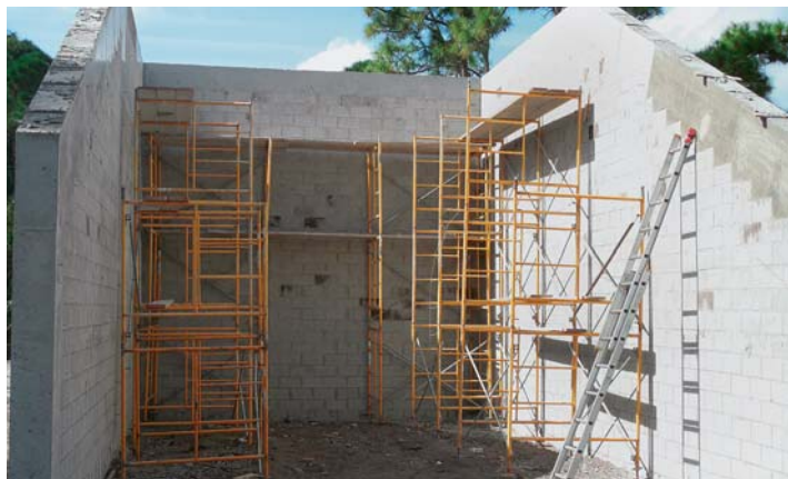
The racquetball court is quickly approaching completion