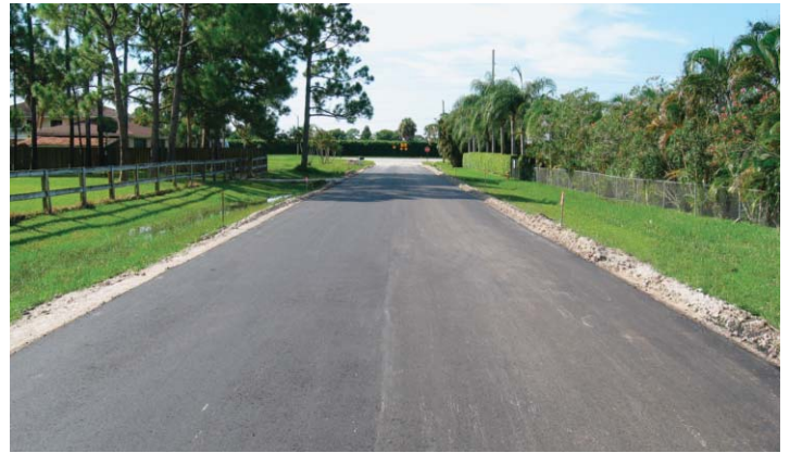
Palm Beach County Standard Asphalt on 67th Avenue in Palm Beach Country Estates

recorded for properties where improvements are being considered so that potential future buyers may be made aware that assessments might be added to the property.