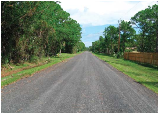
OGEM application on 80th Drive N

The Board also discussed the current policies of a one-year waiting period after a referendum fails and waiting one-year to collect petitions before acting on them. It was determined that the District could continue to pool the petitions and after a year, the Board could determine whether to move ahead with referenda or hold them for an extended period of time. They also elected to leave the current one-year waiting period for landowners to re-